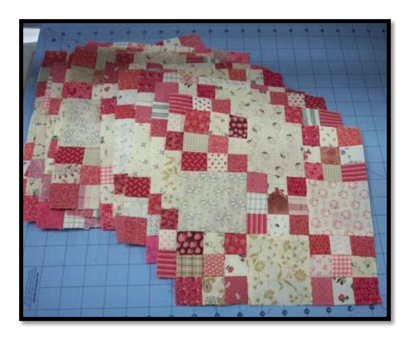
** This ends Clue #5 **